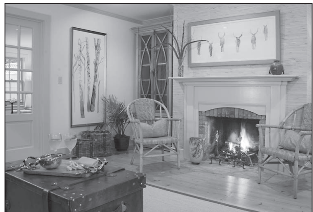
One of the inviting public areas at Deer Brook Inn.

Got bits of business news you want to share? Send an email to mcamp@thevermontstandard.com .